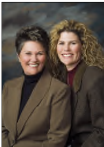
The Chrisman Team